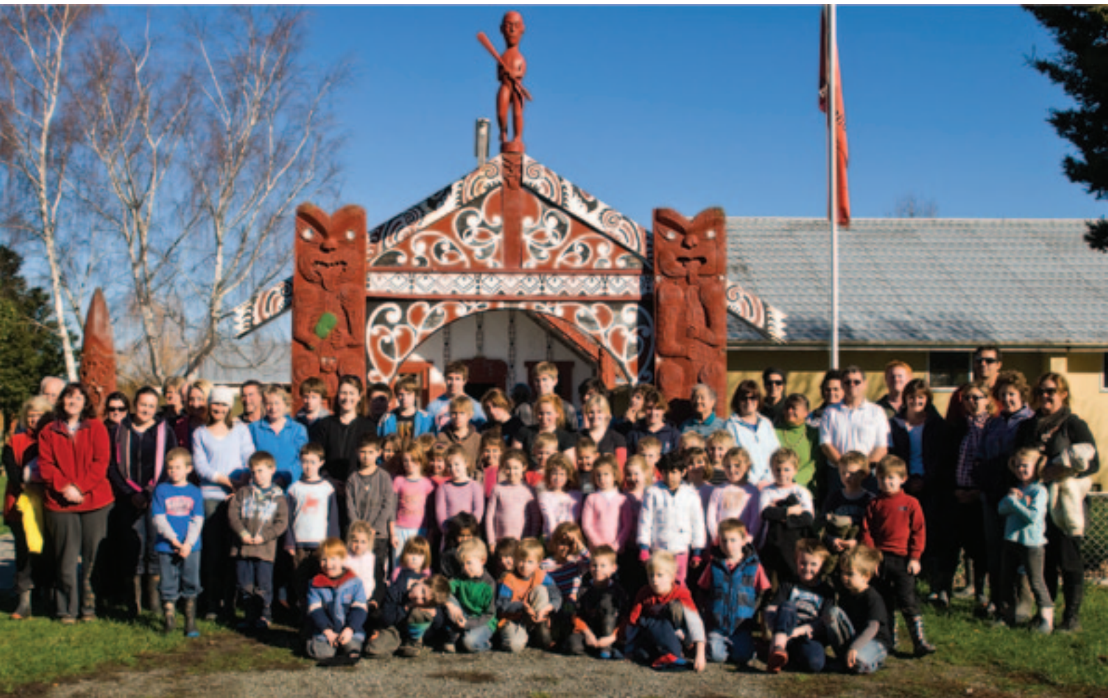
The team who assisted in the planting on the Papawai Stream for Matariki and Arbor Day 2010.

Despite a particularly wet start to the month, July saw a flurry of activity in and around the Papawai Marae and in particular the restoration of the Papawai Stream.