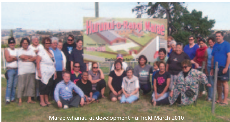
Marae whānau at development hui held March 2010