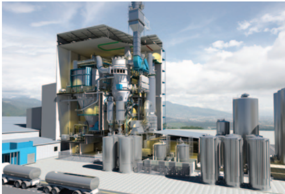
Photo model of the finished factory

“Taking control over the processing of our milk and selling our products directly in to niche markets is a key strategic goal”