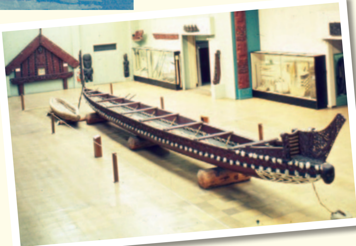
Te Heke Rangatira on display at the Canterbury Museum